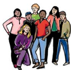
Youth in the Digest!

At this time the Arts in Action team would like to wish all of the Divinity family a blessed Christmas and a very happy and prosperous New Year.